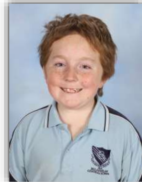
Kai Harvey Literacy Award