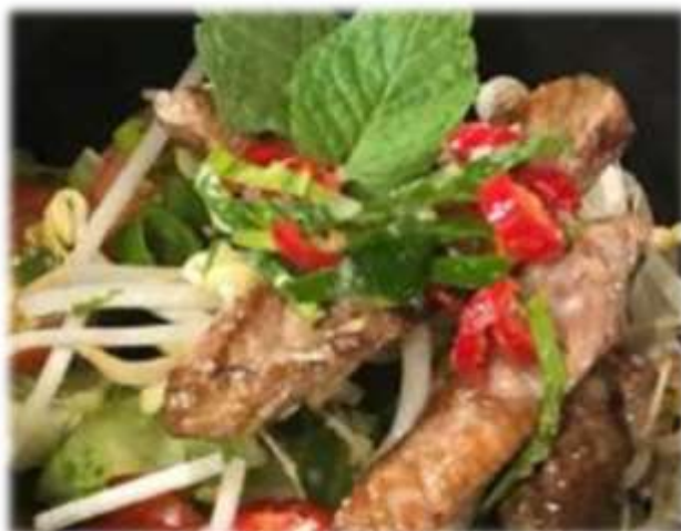
Bake or Burn: Bulahdelah Central School's Thai Beef