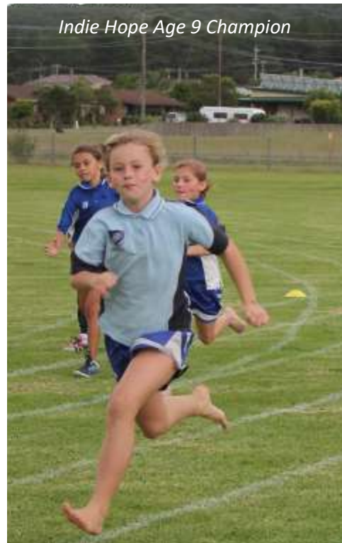
Indie Hope Age 9 Champion

It's a shame mother nature didn't quite co-operate with some rain towards the end of the day as it would have been amazing to see the relay races with some of the times that were set in the 100m finals earlier that day.