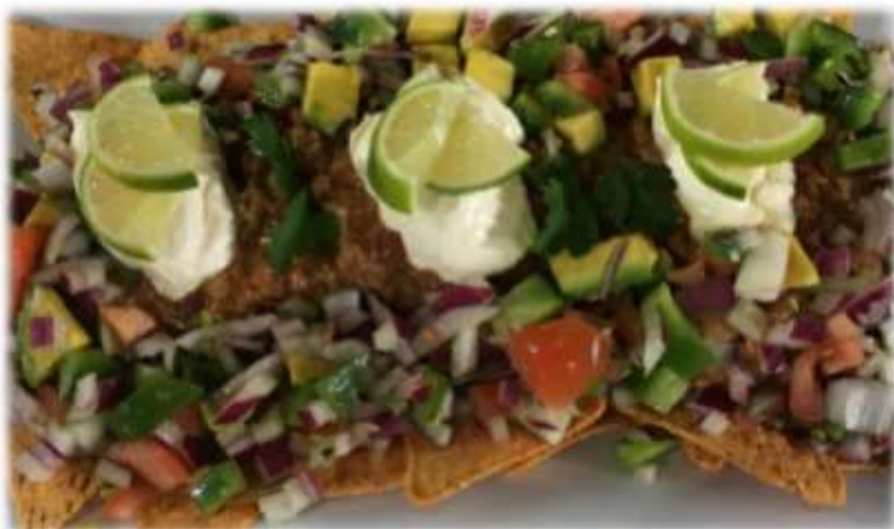
Bake or Burn: Bulahdelah Central School's Beef Nachos with Avocado Salsa