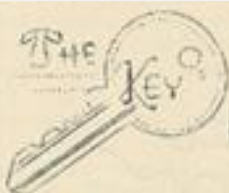
Ads copied from BCS School Magazine Vol. 4 1956

TO SUCCESSFUL SHOPPING - NEWELL'S CREEK - MARKWELL UP TO DATE GROCERY STORE