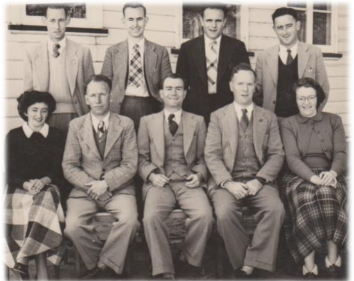
Staff Photo 1954